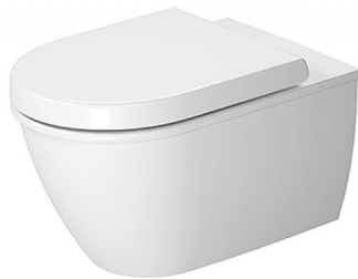
DURAVIT ME BY STARCK 2529090092