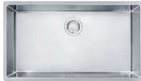
FRANKE - MODEL #CUX11030 / #CUX11027 / #CUX11021