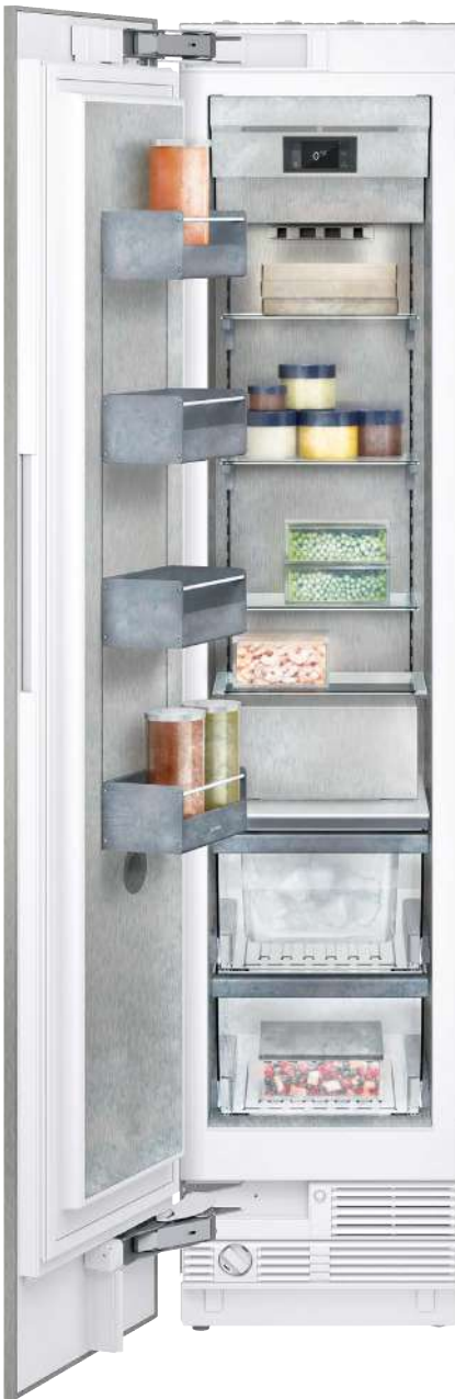
GAGGENAU 400 SERIES FREEZER COLUMN.