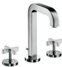
AXOR CITTERIO 39135001