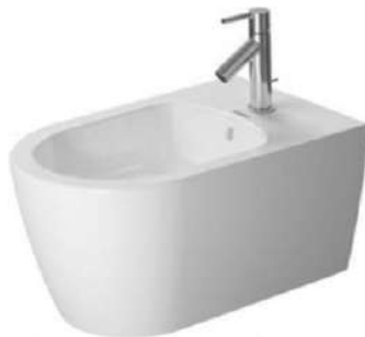
DURAVIT ME BY STARCK 2288150000