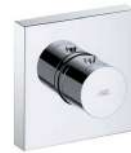
AXOR STARCK THERMOSTAT AX10755001

- AXOR - Form follows perfection. This sentence represents AXOR. Perfection in all its dimensions. In the design. In the technology. In every innovation. In every detail. AXOR'S goal is to finish products off to perfection. The development process continues until there's nothing left to be added or removed. Until the product is more than the combination of form and function.