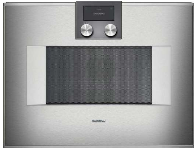
GAGGENAU BM 450