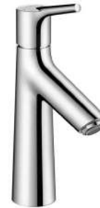
HANSGROHE TALIS S 100 HANDLE W/POP-UP H72020001