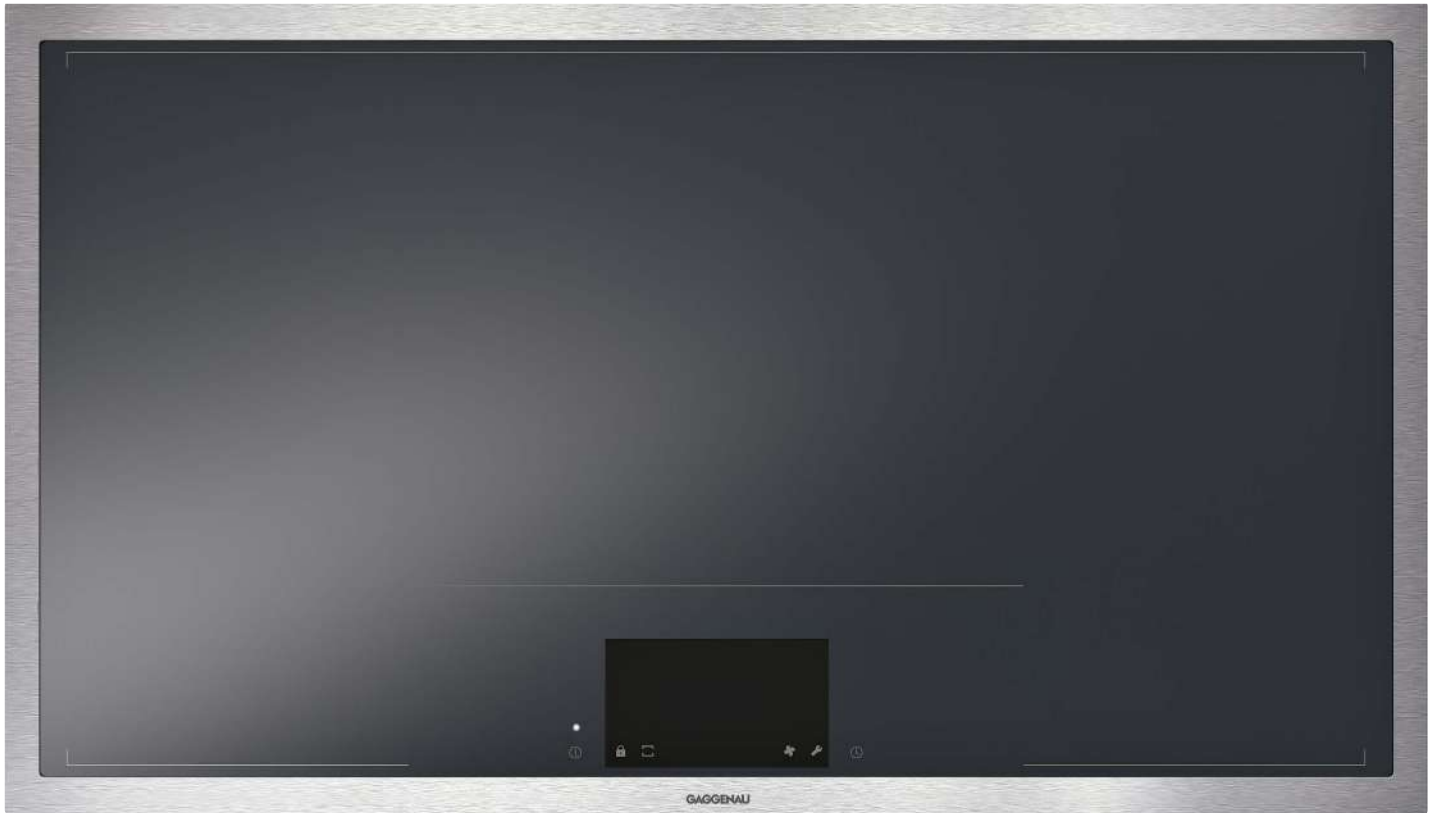
GAGGENAU VARIO 400 SERIES FULL SURFACE INDUCTION COOKTOP.

Developed by G&G Business Developments LLC