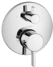
HANSGROHE S THERMOSTATIC TRIM H04231000

• Ecostat Thermostatic trim S with Volume Control and Diverter. Select your shower pleasure, intuitive operation at the touch of a button: one click is all it takes to change the spray mode, activate another shower or turn the water on and off.