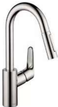
HANSGROHE FOCUS FAUCET H 04505000