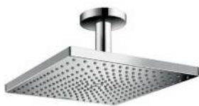
HANSGROHE RAD E 300 SHOWER 26240001

- AXOR Citterio combines the best in one collection. Corners, edges and a distinctive flat design. These set the stage for the light, to be perfectly reflected. Projecting radii. Precisely worked out. These references transform the collection into a masterpiece of the neoclassicism of the 1930s. And ensure that it looks monumental on the sink. Perfection, design by Antonio Citterio