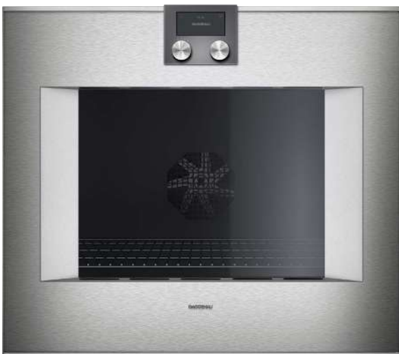
GAGGENAU BO400 SINGLE - OVEN