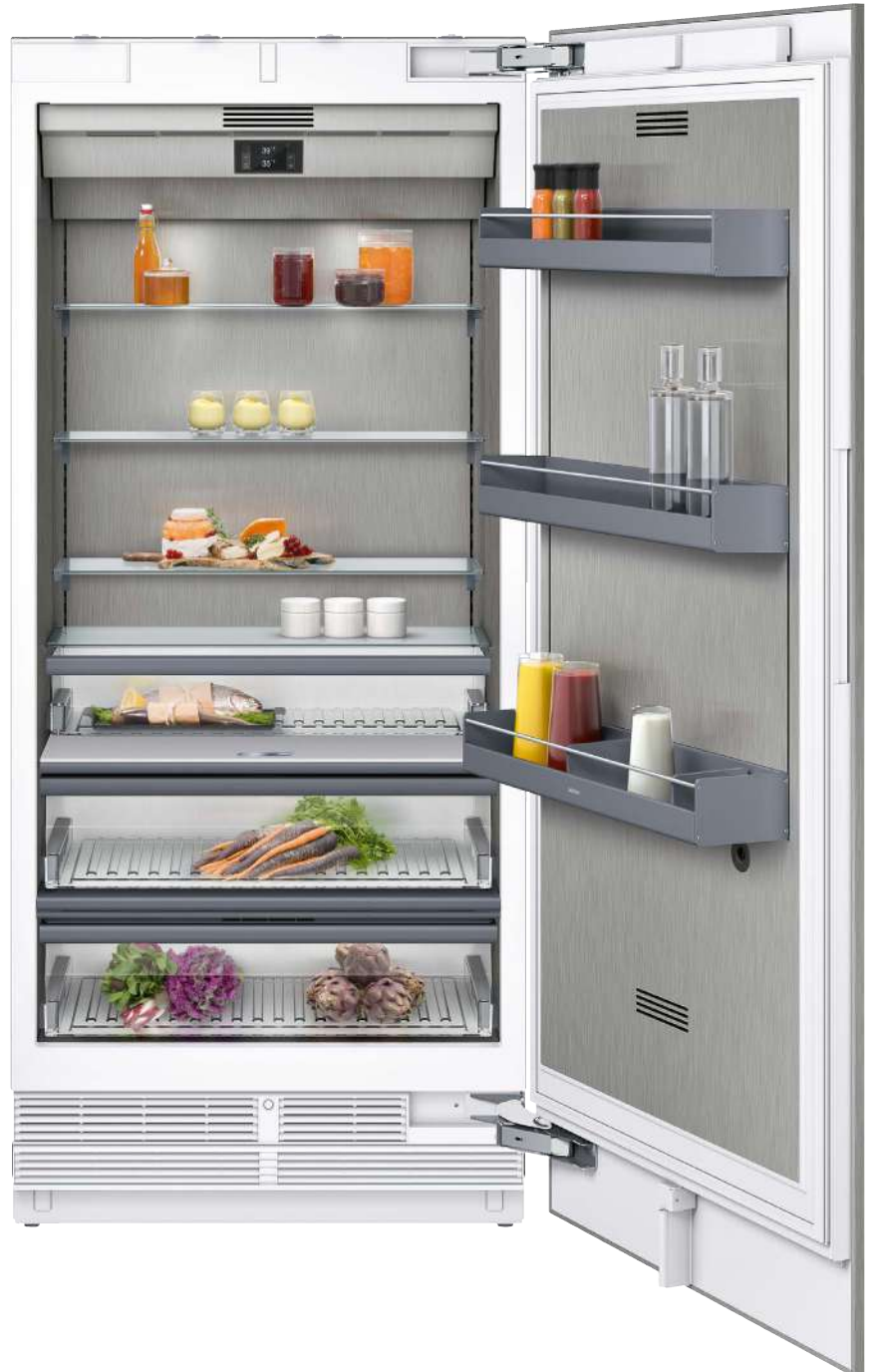
GAGGENAU 400 SERIES REFRIGERATOR COLUMN.