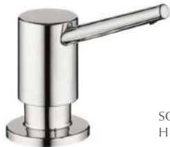
SOAP DISPENSER HANSGROHE H 04539000