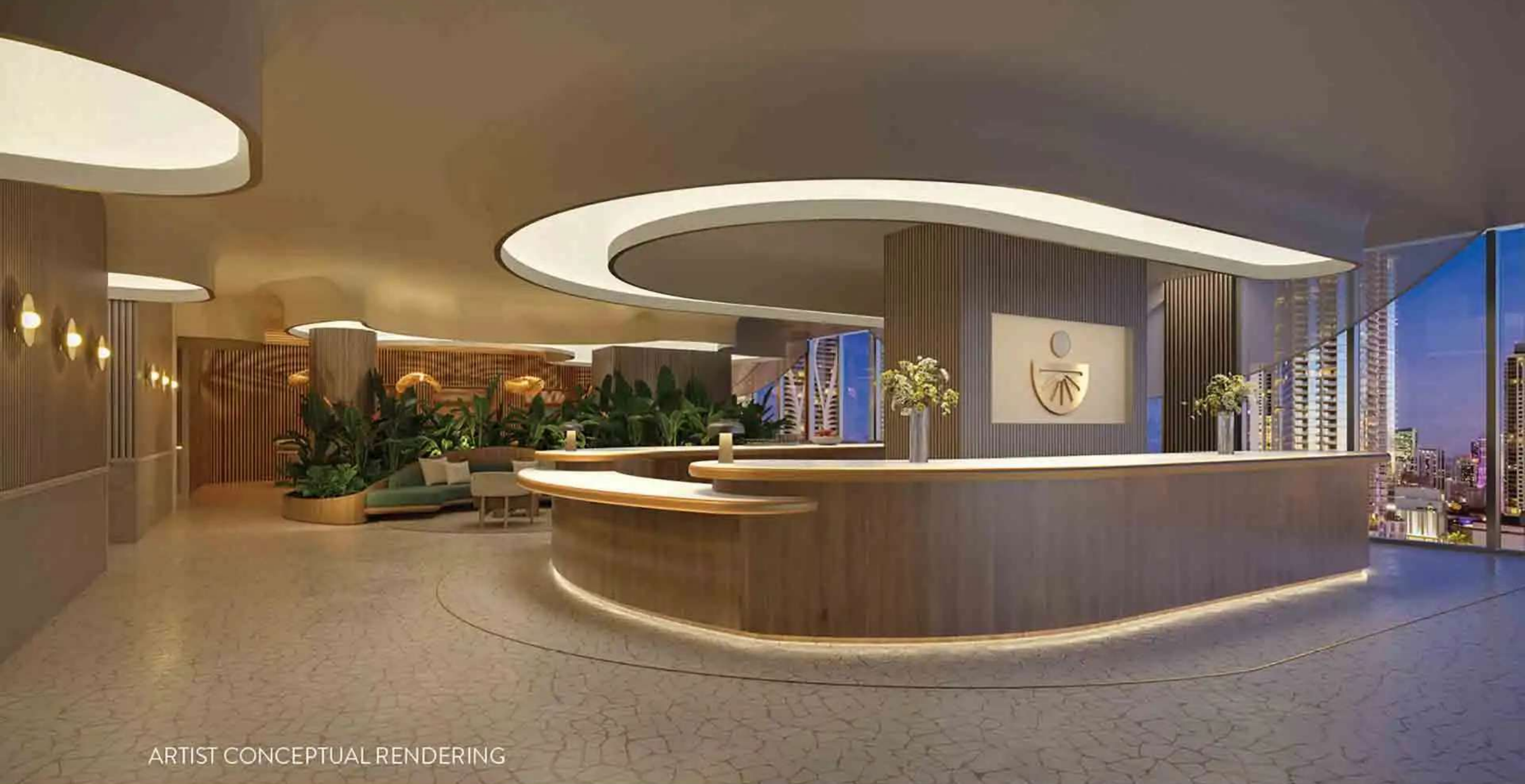
ARTIST CONCEPTUAL RENDERING