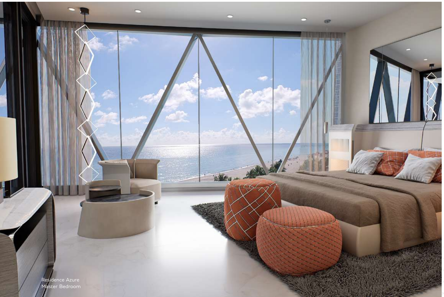
Residence Azure Master Bedroom