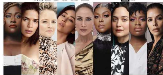
Meet ELLE'S 2023 Women in Hollywood