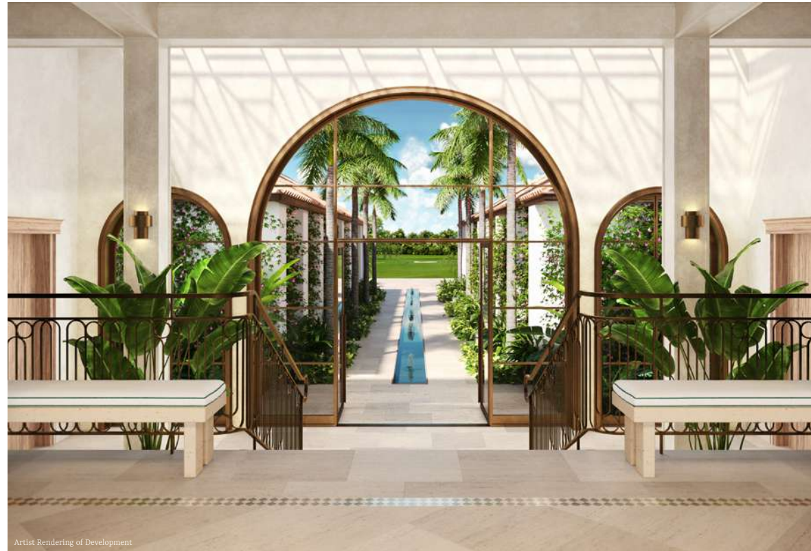
Artist Rendering of Development

Private marina featuring a boutique market and cocktail bar