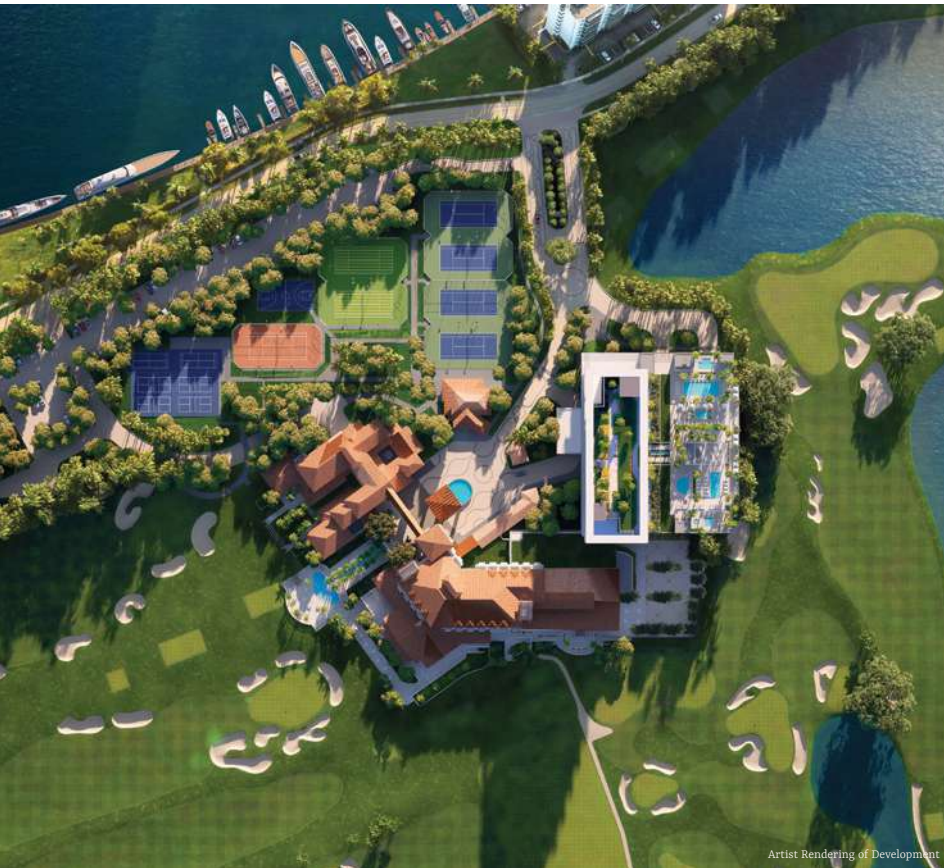
Artist Rendering of Development